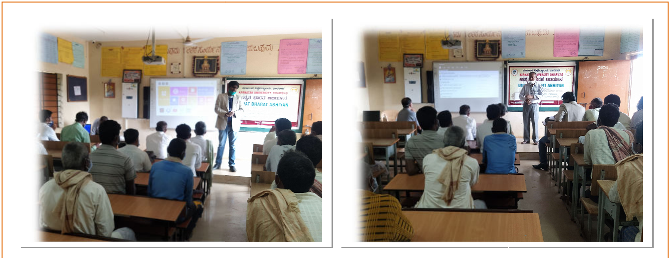
Addressing about the importance of Solar Pump Set Technology.

UBA KUD collaborated with Selco Solar pvt ltd, Dharwad and jointly organised many Awareness Programmes on Solar energy and Solar Machines. The Awareness programme led to develop the skills for Livelihood in adopted villages.