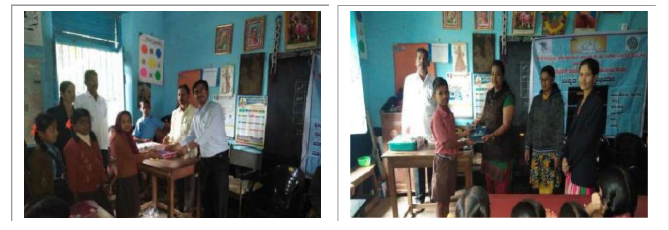
Conducted Free Book Drive programme, through this Drive different kind of Books and stationery materials were donated by the Faculties and Students. Under this Drive more than 300 books were distributed to the school children of the adopted villages.