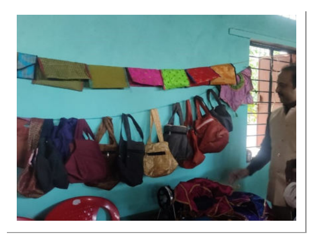
Exhibited handmade bags which were crafted in 5 days workshop