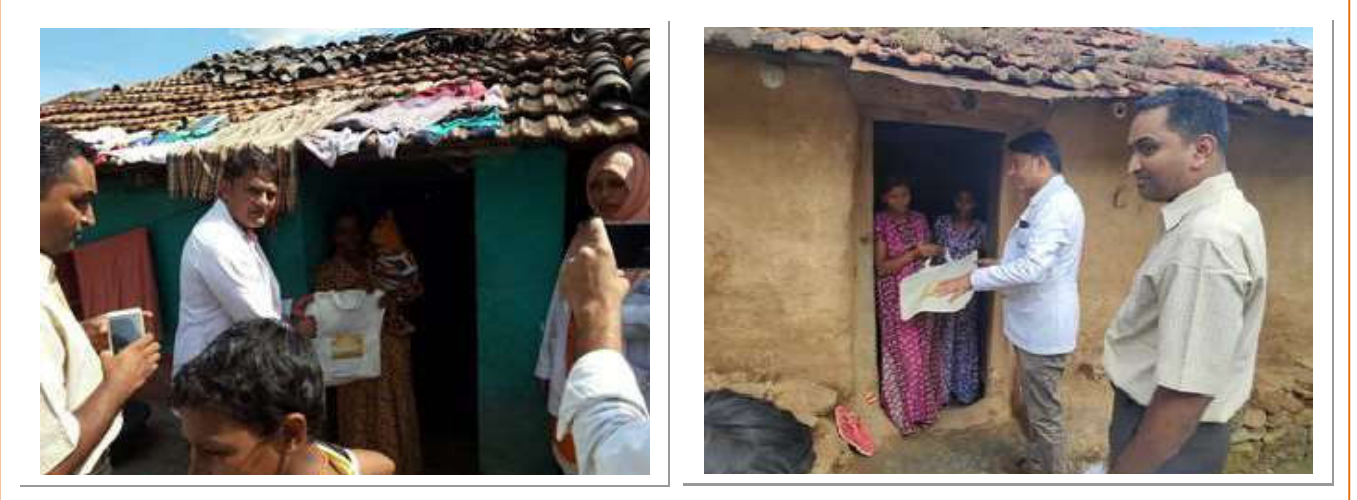
House to House Plastic free village rally and Cotton bags distribution