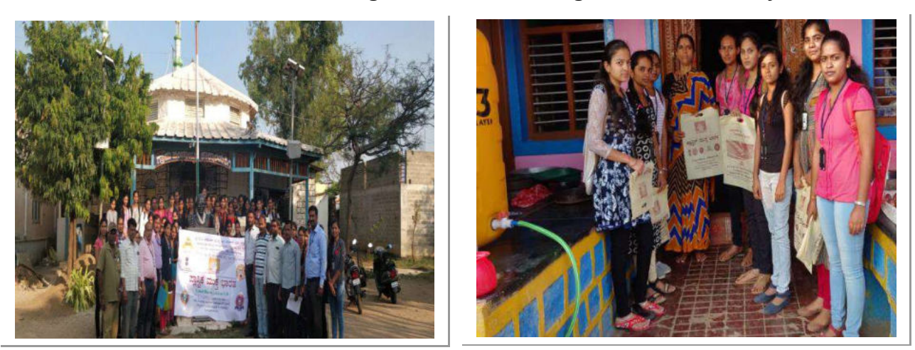
Plastic Free Campaign and distributed Cloth bags in the village.