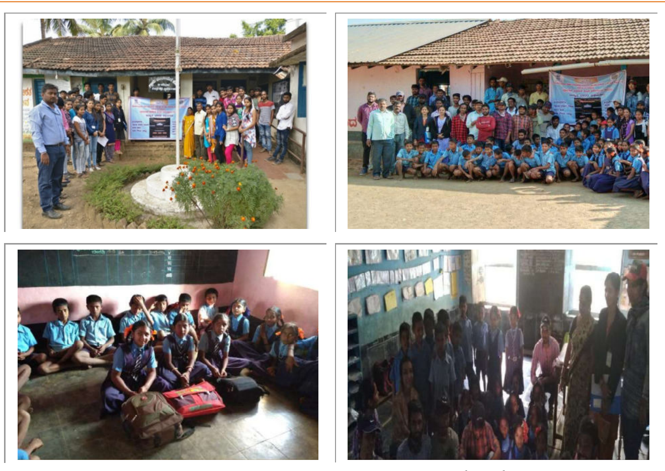
Education Awareness Programme and Interaction with class 5<sup>th</sup> & 6<sup>th</sup> school children

Vishwanathrao Deshpande Institute of Technology, Haliyal organised Education Awareness Programme for Govt school students in UBA adopted village Havagi.