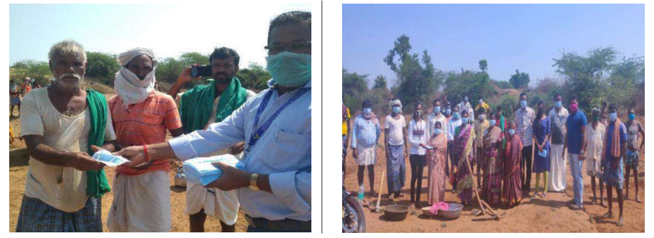
Distributed masks to the villagers who were working under NREGA Project.